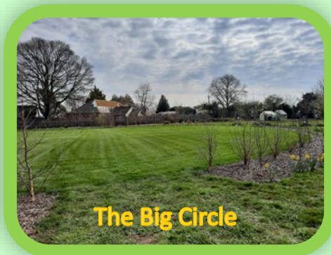
The Big Circle

BBQs: Remember our initial BBQs? Well they WILL happen again – real soon. We've had a few health issues, holidays and busy working on many projects. BUT, we want to invite everyone to see our facilities and maybe join us. It's not all about gardening