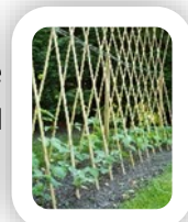
Runner Bean Frame

Runner bean plants can be set outside for cropping in July and August but, before they go in, building a frame for the plants to climb will both help to support them and make picking easier too. By mid-May it's a good idea to plant pumpkin seedlings into the ground for an October harvest in time for Halloween.